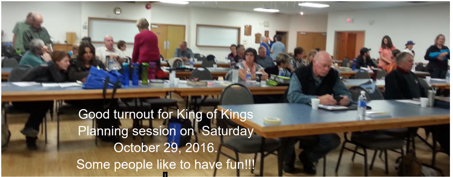
Good turnout for King of Kings Planning session on Saturday October 29, 2016. Some people like to have fun!!!